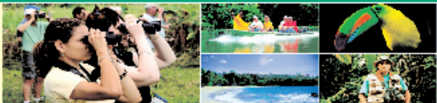
Costa Rica scenes. Negro Wildlife Refuge, Toucan Park, Land of the Living Volcanoes, Hacienda, Monte Arenal Park.